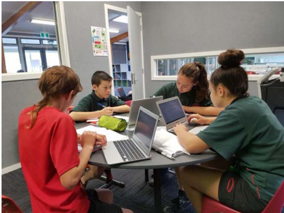
Area 2, Haepapa, students working in Wainuiomata's first Flexible Learning Space.