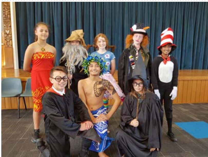
Book Week Winning Characters 2017