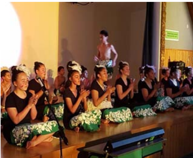
Celebrating Cultural Week