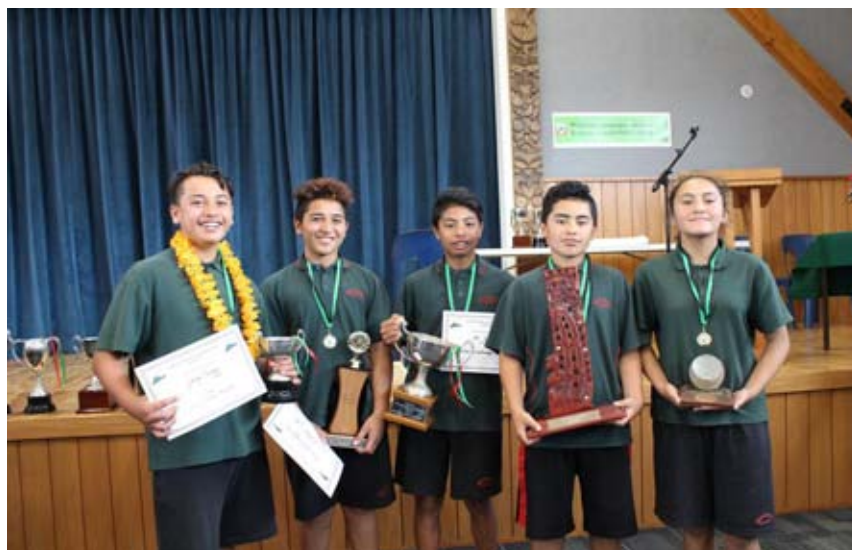
2016 Year 8 Awards Assembly