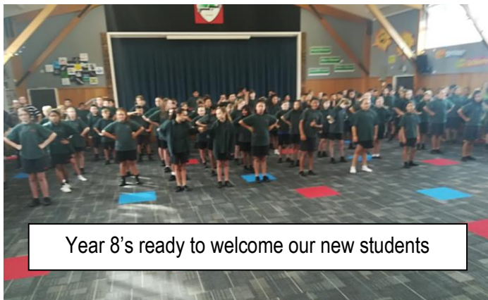
Year 8's ready to welcome our new students