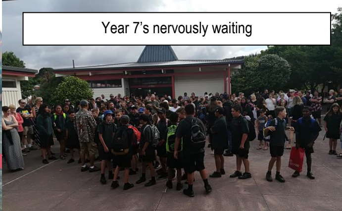
Year 7's nervously waiting